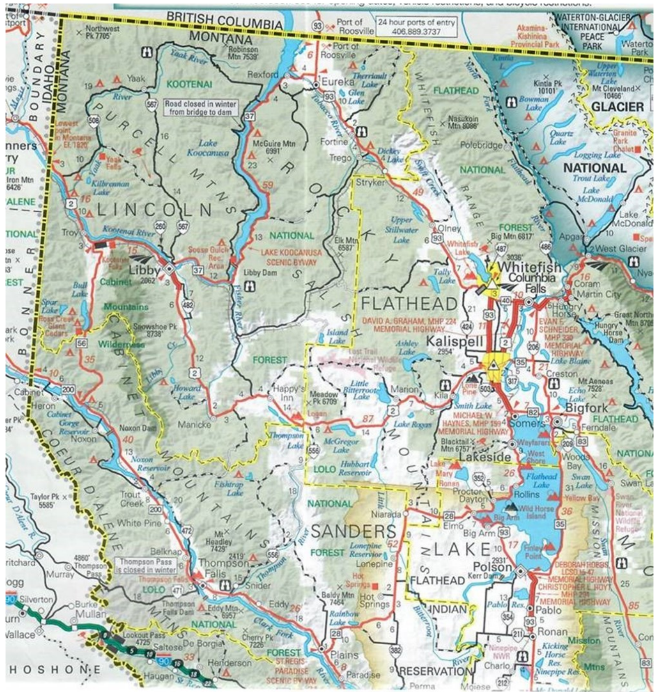
Regional Highway Map - Kalispell, Montana.