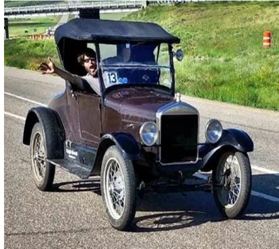
Ralph Brevik waving to the flaggers.