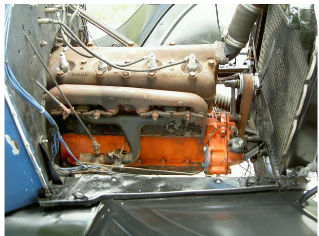
The Power Plant. Pictures from May, 2005.