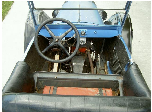
Interior of the car, minus the seat and floor boards.